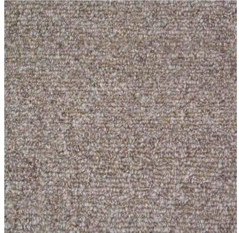
Olefin - Looped