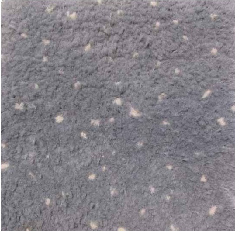
Olefin - Knotted