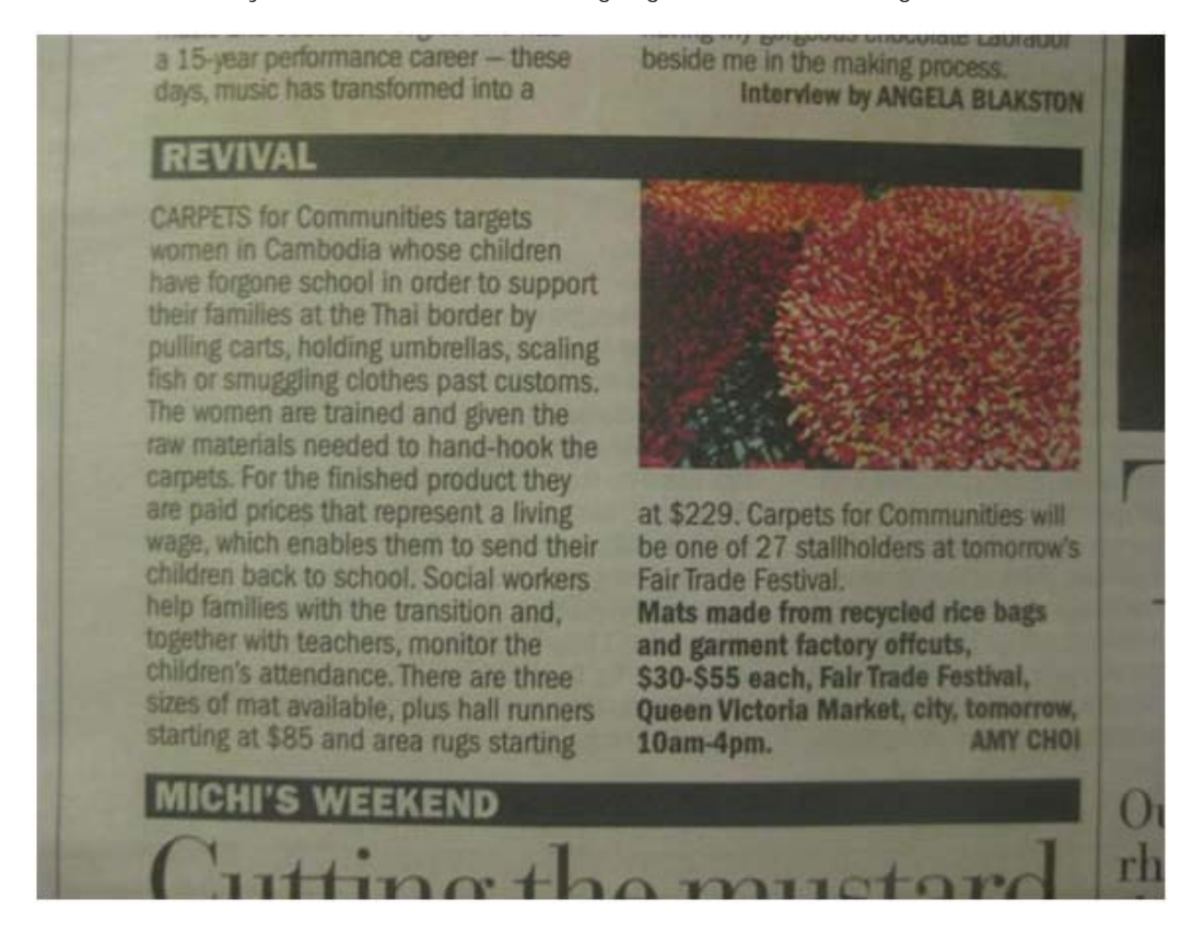
The Age, A2 Magazine Sunday 15th May 2010

It was really exciting when CfC was featured in an article on The Age a day prior to the Fair Trade Festival! We did extremely well at the festival selling a grand total of 23 rugs.